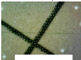
Membrane analysis directly prior to testing

In order to drain the resin that was loosened by the new DEX lubricant, a CC Jensen offline filter was installed, using a filter medium that traps and holds the resin, thus allowing the resin to be removed from the oil with the replacement of the filter insert.